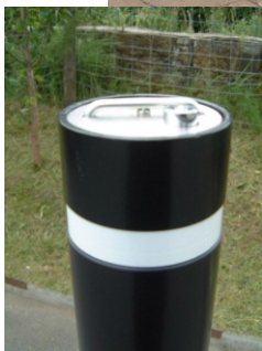
Telescopic Posts can be supplied with recessed reflective bands