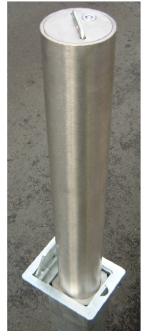
Stainless Steel Telescopic Security Post

A range of Telescopic Security Posts provide a simple, secure and cost effective method of protecting your premises. Precision manufactured, these security posts are the perfect barrier to crime. Strategically located on forecourts, car parks or shop fronts security posts are a true 24 hour deterrent, whilst remaining aesthetically pleasing.